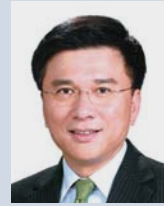
Professor the Honourable KC CHAN, GBS, JP Secretary for Financial Services and the Treasury